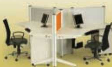
Pole Based System