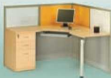
46/60mm Panel System