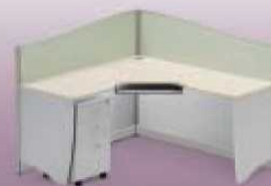
25mm Panel System