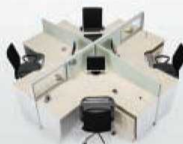
75 x 25 mm Hybrid System